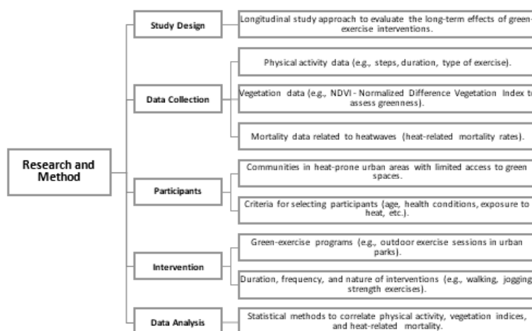
Table 1. The structure of the Research Methodology flowchart.

This study uses a longitudinal design to assess the long-term impact of green-exercise interventions on heat-related mortality in heat-prone urban areas with limited green spaces. Data will be collected on physical activity (steps, duration, type of exercise), vegetation (NDVI to assess green space), and heat-related mortality rates. Participants will include adults from vulnerable communities, especially those with pre-existing health conditions, living in areas with high heat exposure and low vegetation. The intervention will involve green-exercise programs (walking, jogging, strength exercises) in urban parks over 12 to 24 weeks, aiming to promote physical activity and provide cooling effects. Statistical analysis, including regression and Cox models, will examine the relationship between physical activity, green space, and heat-related health outcomes.