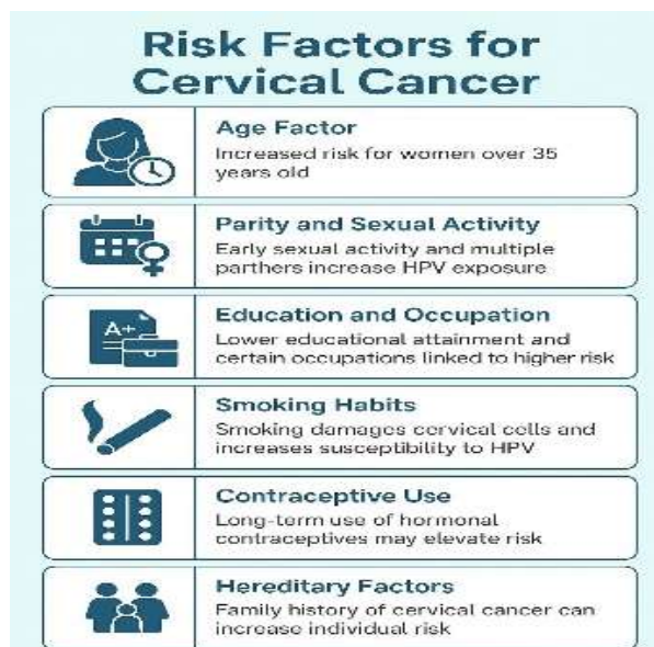
Figure 1. Risk Factors For Cervical Cancer